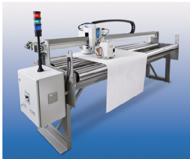
FX 3500-T3 for determination of air permeability and thickness

the test results is not included in the scope of supply. However, the necessary software is included.