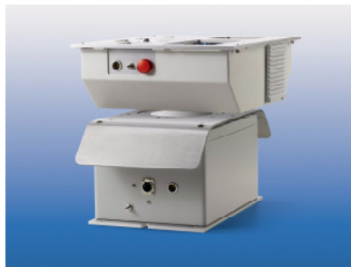
FX 3500-BW, basis weight test head