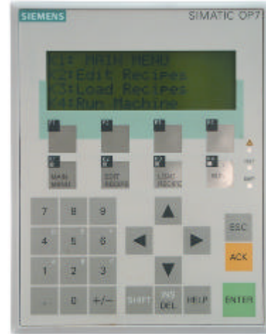
Programmable Control Panel