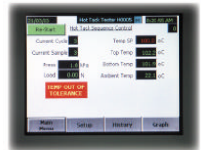
Touch Screen Operation

10-11 Colorado Court, Hallam, Victoria 3803 Australia.