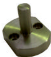
Cutting Die Adaptor

Can be used with the following Cutting Dies