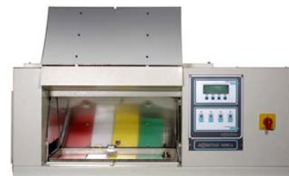
Salt spray chambers 8 Models